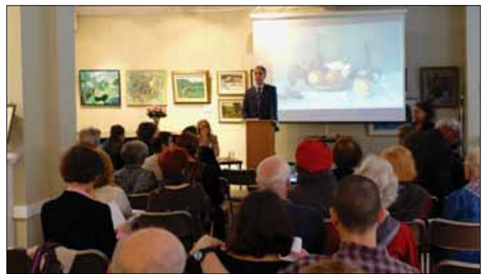
At the Fine Art Auction, Sunday, October 30, photo by Gord Fulton