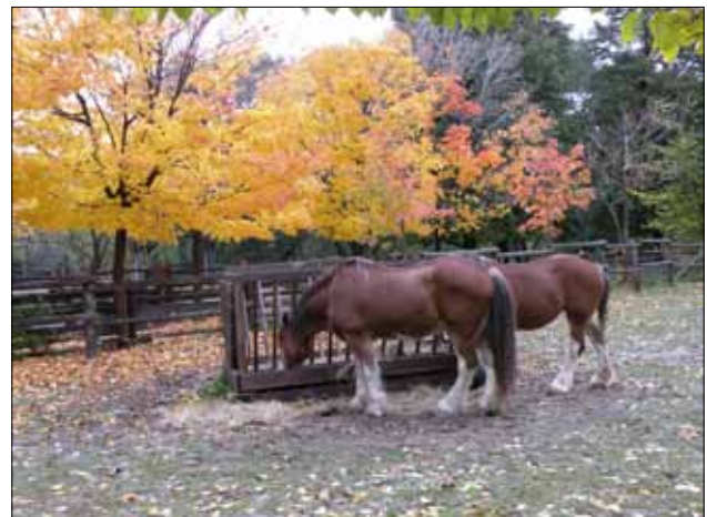
Autumn , photo by George Rust-d'Eye