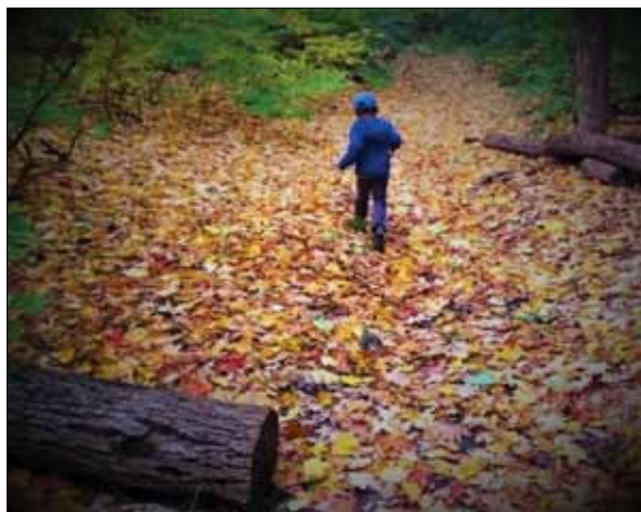
Fall Sunday in the Ravine

So we are delighted that this entertaining and engaging personality will join us on November 28, to talk about her experiences in acting, directing, and much more. You may know her from Orphan Black , or from her own series, Mom, P.I. She appeared this season at Stratford in A Little Night Music (she sang Liaisons ) and The Lion, the Witch and the Wardrobe —her c.v. could fill a book!