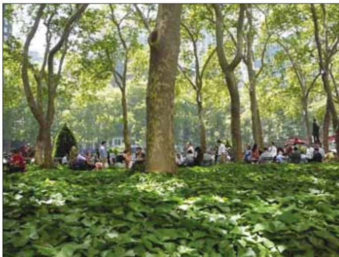
Summer, Bryant Park